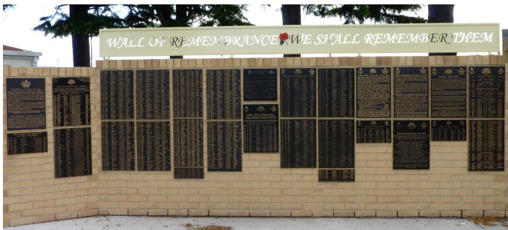
Wall of Remembrance, St. Helens, Tasmania

"What these men did nothing can alter now. The good and the bad, the greatness and the smallness of their story will stand. Whatever of glory it contains nothing now can lessen. It rises, as it will always rise, above the mists of ages, a monument to great hearted men; and for their nation, a possession forever. "