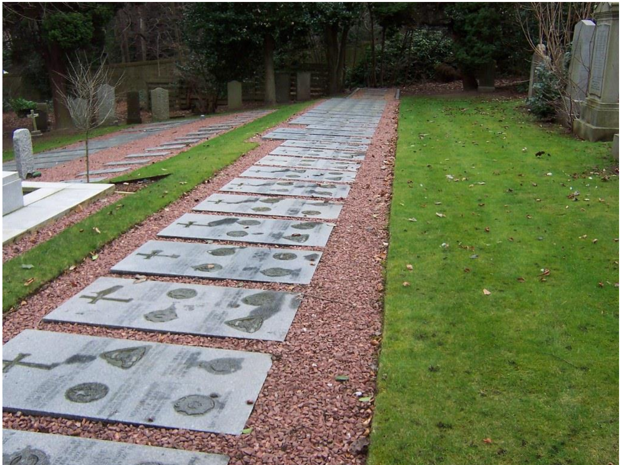
Communal Commonwealth War Graves plot in Section D